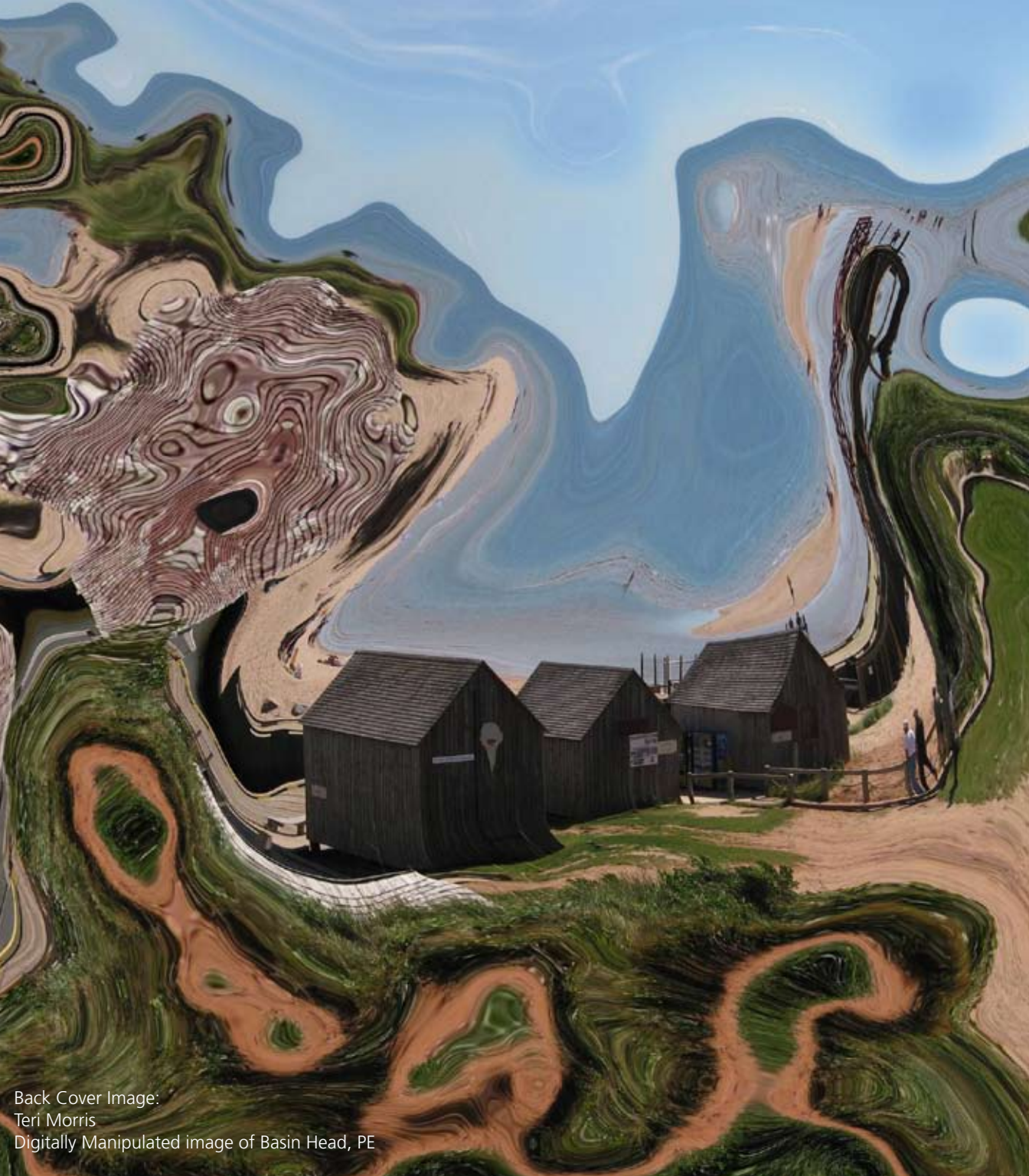
Back Cover Image: Teri Morris Digitally Manipulated image of Basin Head, PE